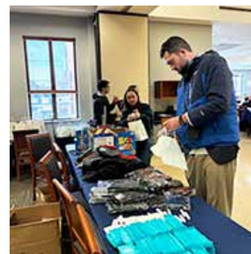
(ElmU students, staff and faculty came together on Founders Day to pack 100 cold weather kits to be delivered to Night Ministry clients.)